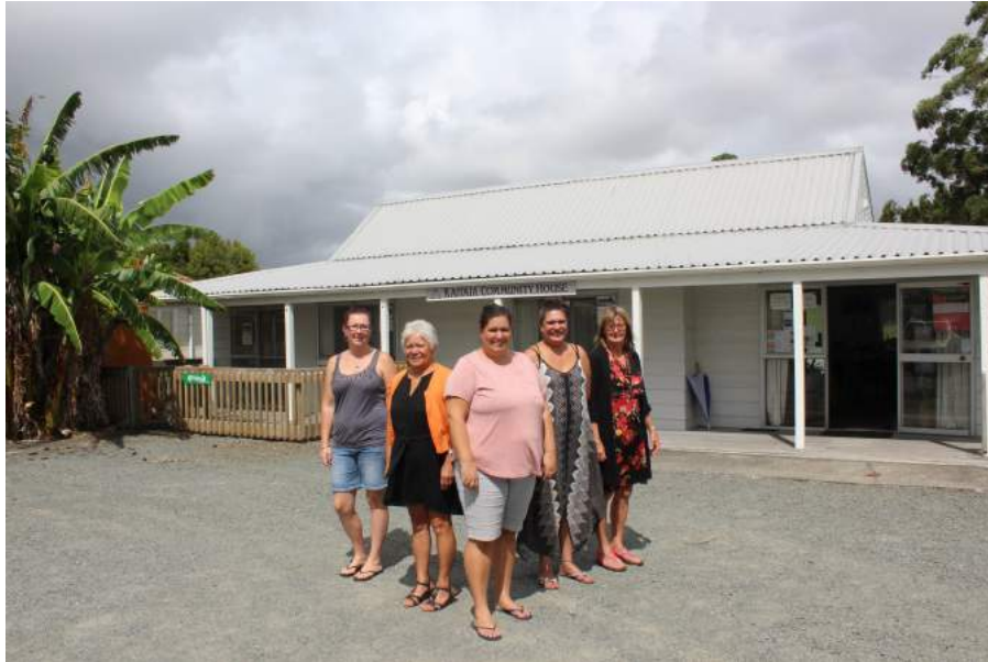
The team at Kaitaia Community House wish everyone a safe and happy Easter.