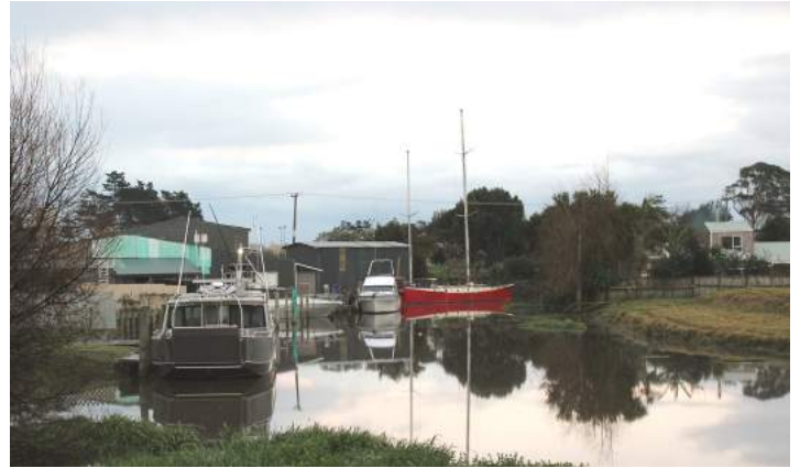
Awanui is a small river town but it has plenty to offer visitors.

● Mana Kai Honey is offering a giveaway pack worth $104 to Kaitaia Connect readers, see page 1 for details of how to enter.